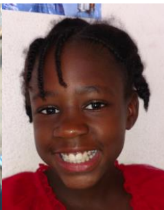
Tatane – 9