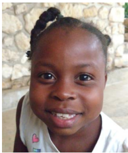
Miselane – 9