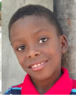
Deiu-Maitre – 8