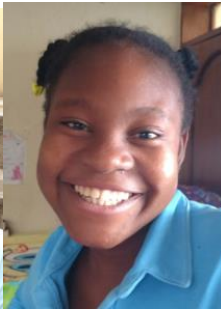
Mivelore – 12