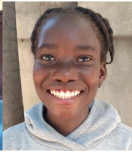
Wegthlande – 11